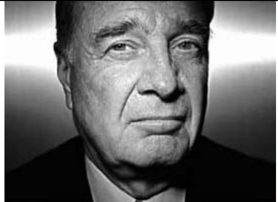
Would you vote for me?

Comparing/Contrasting: Encourage your students to think about different perspectives as they brainstorm similarities and differences for this writing assignment. Any positive distinction might be seen as a negative characteristic from a other points-of-view. A generous nature might be viewed as a money-waster or as an encourager of begging by less-than-positive others. As students brainstorm for these, encourage creative and critical thinking.